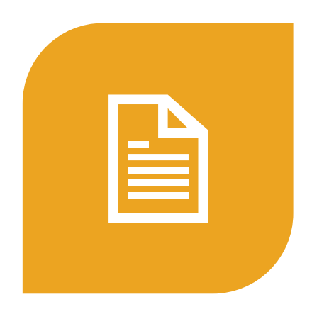
Easy to Navigate