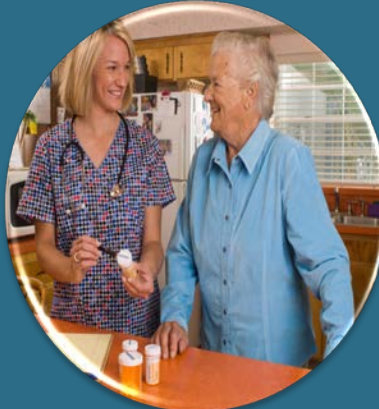
Removing Barriers to Practice and Care