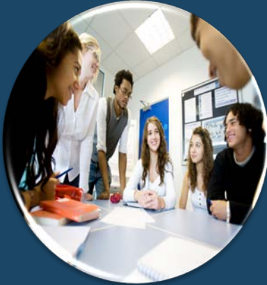
Advancing Education Transformation